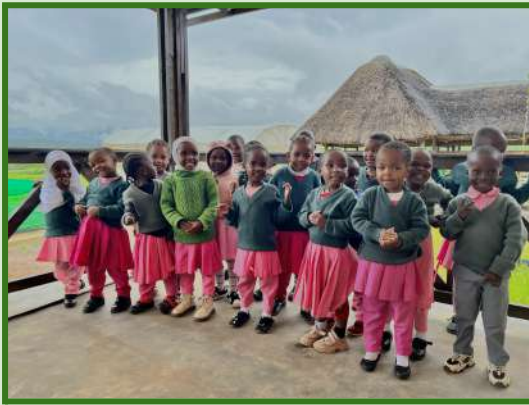
(Kids Corner students)

We recently had the pleasure of hosting a group of enthusiastic children at our farm. We received 18 kids aged 4 to 5 years old from Kids Corners and standard VI students from Sunflower Pre and Primary school. Through engaging activities, interactive classes, and hands-on experiences like feeding animals, holding them, we sparked their curiosity about agriculture. From planting seeds to nurturing crops and caring for animals, these young minds discovered the joy and rewards of farming.