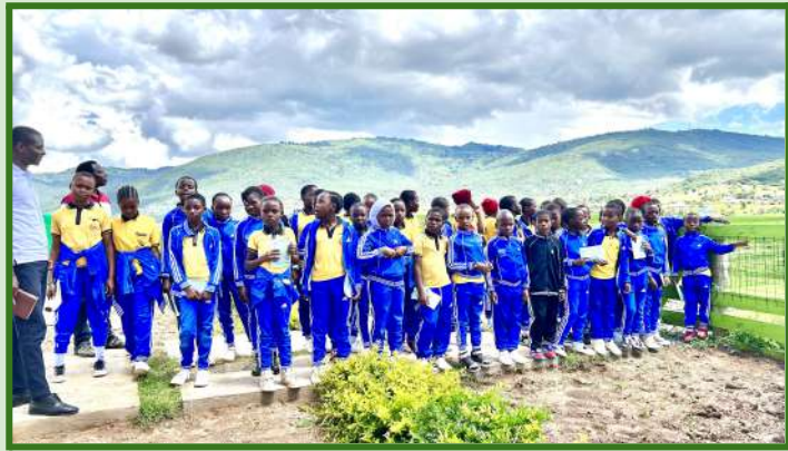
(STD VI from Sunflower Pre- and Primary school)