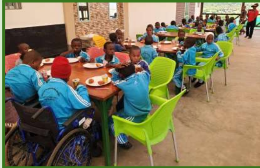
(Students from St. Felix Primary School)