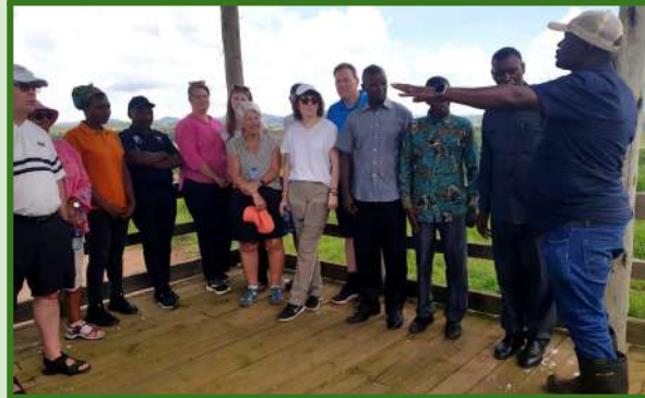
( group of 14 visitors under the Lutheran Church in Ilala coming from the Sweden and Germany came to visit the farm earlier last week)